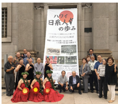
Former Bank of Japan branch, Hiroshima, Japan (October 2017)