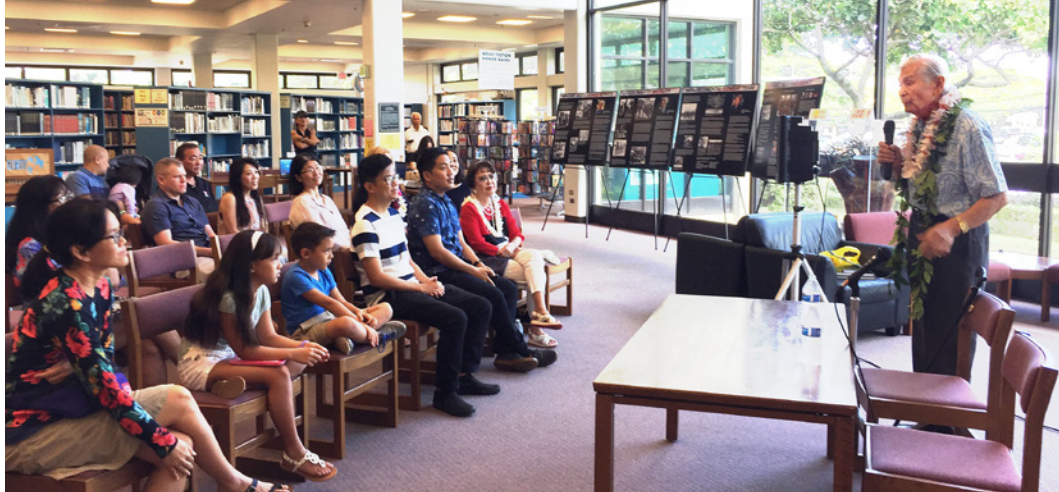
Former Governor George Ariyoshi gives the opening remarks for the NVL exhibit at the Salt Lake – Moanalua Public Library.