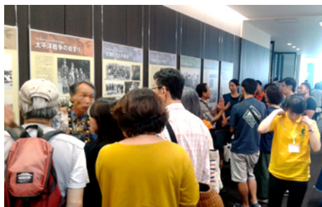
Hawaii Expo, Shibuya, Tokyo (July 2017)

1–14). The HNLE appeared in conjunction with a visit by the Honolulu Hiroshima Kenjin Kai as part of the 20th anniversary celebration of the Sister State relationship between Hawaii and Hiroshima Prefecture.