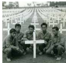
Epinal Cemetery in France

■ As a follow up to the Congressman Ed Case article in the February 2020 NVL News newsletter, the Congressman's office was able to obtain a list of known Nisei Soldiers buried at overseas European cemeteries. However, rather than creating bios for these Soldiers and making them available on-line at the Cemeteries, the Sons & Daughters of the 442nd RCT will launch a limited alternate pilot project. It will involve Sons & Daughters members developing formatted bios for their 442nd RCT Nisei Soldier ancestors