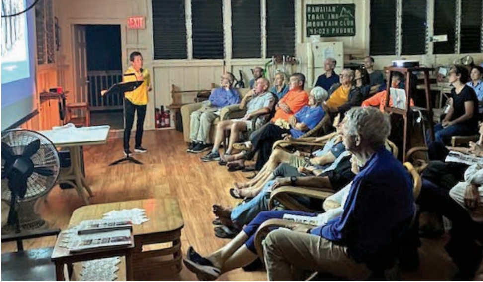
Hawaii Trail and Mountain Corporation