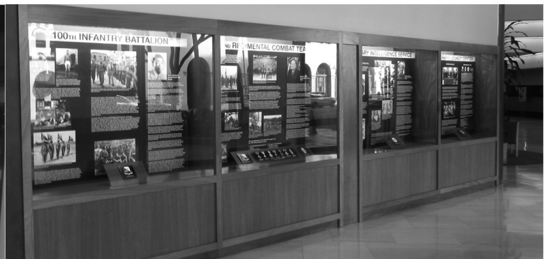
Exhibit at Central Pacific Bank