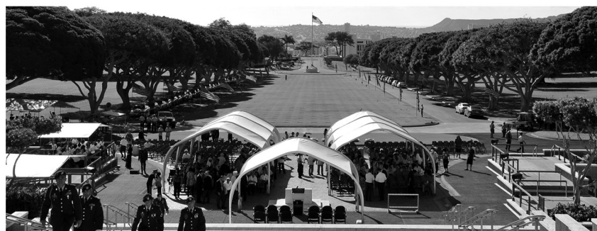
Joint Memorial Service at Punchbowl