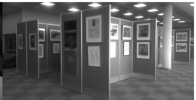
“Go For Broke” Traveling Exhibit