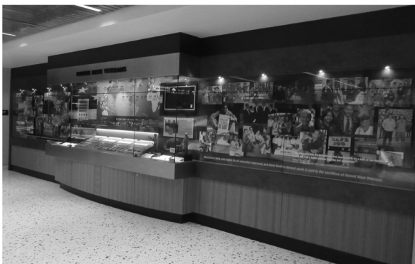
Permanent Exhibit at the Interisland Terminal, Honolulu International Airport