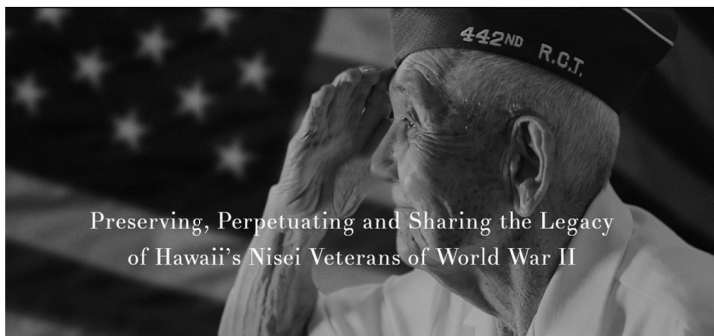
Nisei Veterans Legacy website ( nvlchawaii.org )

In 2015, we launched our website ( nvlchawaii.org ) which was a major step in our campaign to promote the legacy of the Nisei soldiers of World War II. For the past four years, the NVL has sponsored and organized the Joint Memorial Service in September to honor the fallen members of all four Japanese American units in World War II.