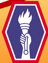
442nd REGIMENTAL COMBAT TEAM