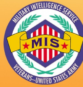
MILITARY INTELLIGENCE SERVICE