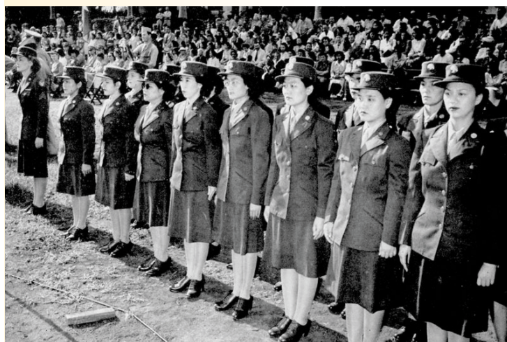
Members of the Women's Army Corps in Hawaii, ca 1940s.