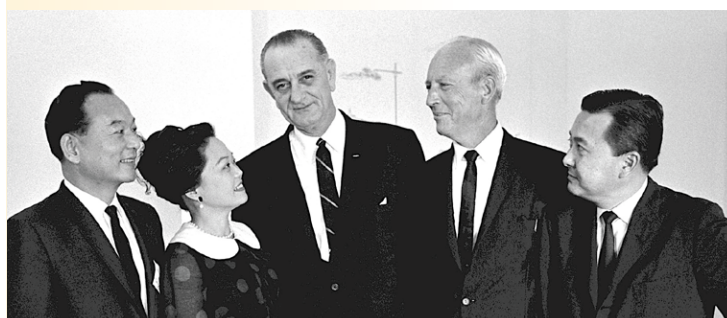
Left to right: Hawaii Congressmembers Spark Matsunaga & Patsy Mink, Pres. Lyndon Johnson, Gov. John Burns & Hawaii Senator Daniel Inouye.